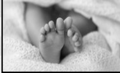
Beau Reid Reyes

Beau was born January 22nd, and he weighed 8 lbs. 11 oz. and is 21.25" TALL!